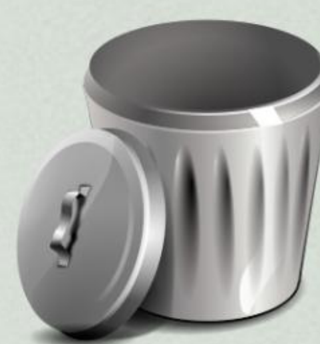
Handle garbage or cleaning supplies