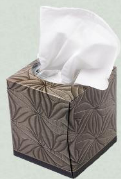
Cough, sneeze, or blow your nose