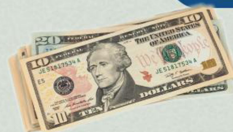
Touch money or anything soiled