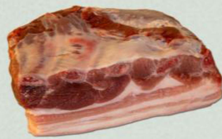
Handle raw meats, seafood, or poultry