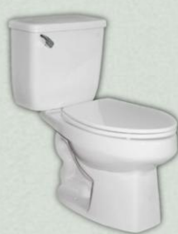
Go to the bathroom