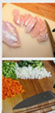
Start a new task