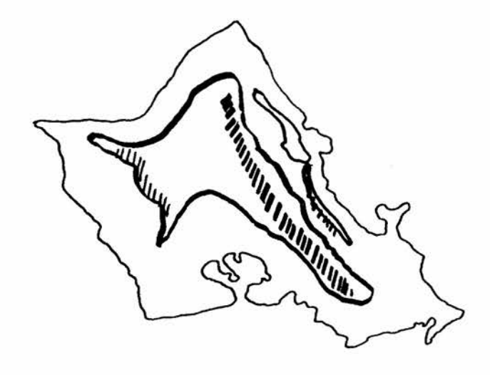
Figure 1. Areas currently supporting koa (////) and proven potential to support koa (within dark lines) on O'ahu.

tunity to build forests on lands recently vacated by the sugar trade to ensure that in the long term we catch and hold the maximum amount of precipitation that passes over the islands. It is also worth mentioning the relative ease with which these lands could be managed compared to the more precipitous or inaccessible interior regions.